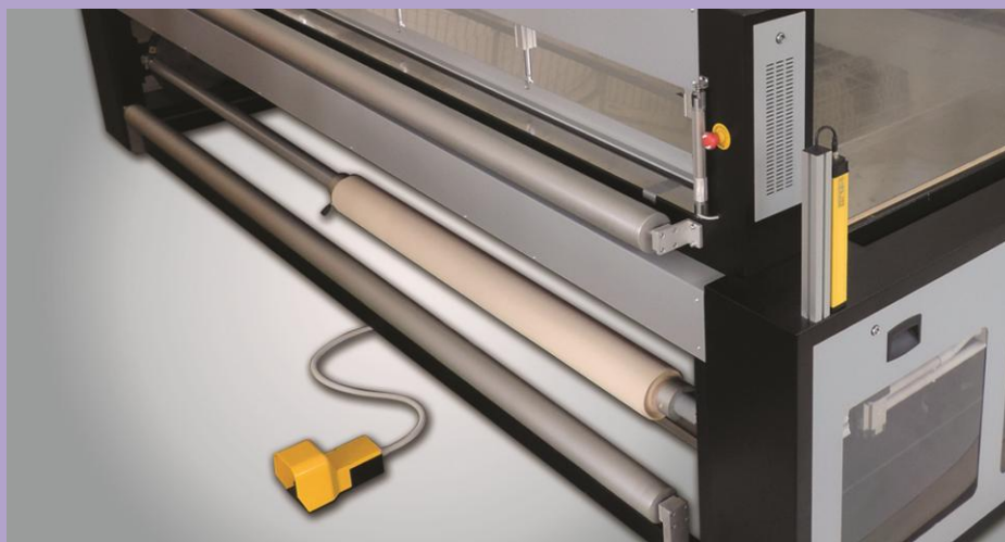
Storage carrousel for fabric coils